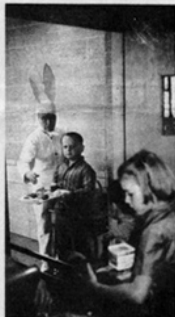
The Easter Bunny came to life for G. B. Youngsters as cafeteria Workers masquerade in "Easter Styles".